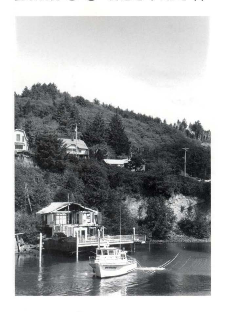
SPRING / FALL 2001