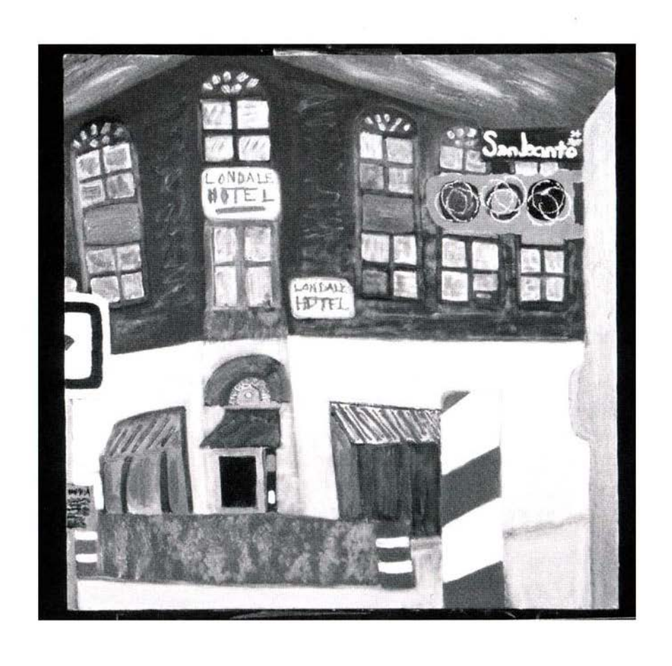
Untitled Photographed Artwork by Heath Ferrell