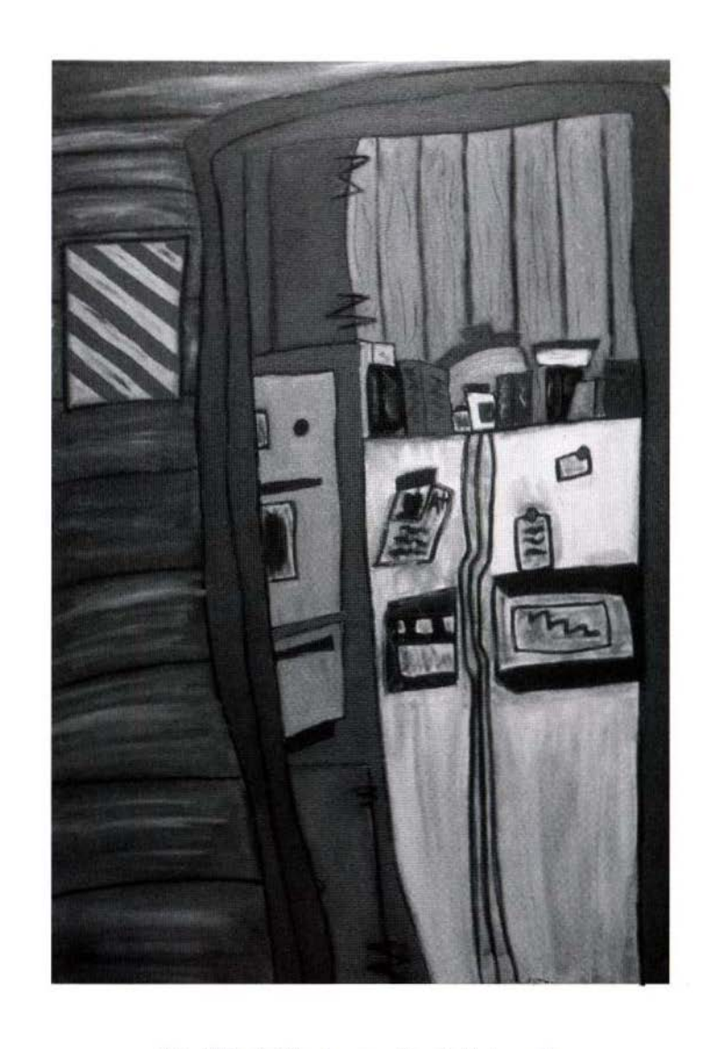
Untitled Photographed Artwork by Heath Ferrell