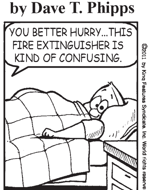
LAFF - A - DAY