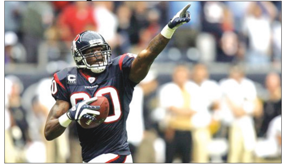
Houston Texans wide receiver Andre Johnson.

What are the Texans to do if this noticeably upgraded team merits little or no change in overall performance, especially