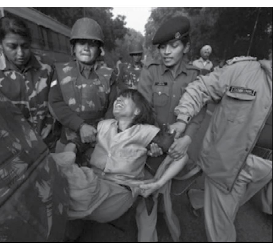
Police remove protesters from the area oustide the courtoom in New Delhi

tempted to cover up the assault by giving the child a bath and attempting to destroy her clothes. The headmistress also cleaned the toilet where the assault had occurred.