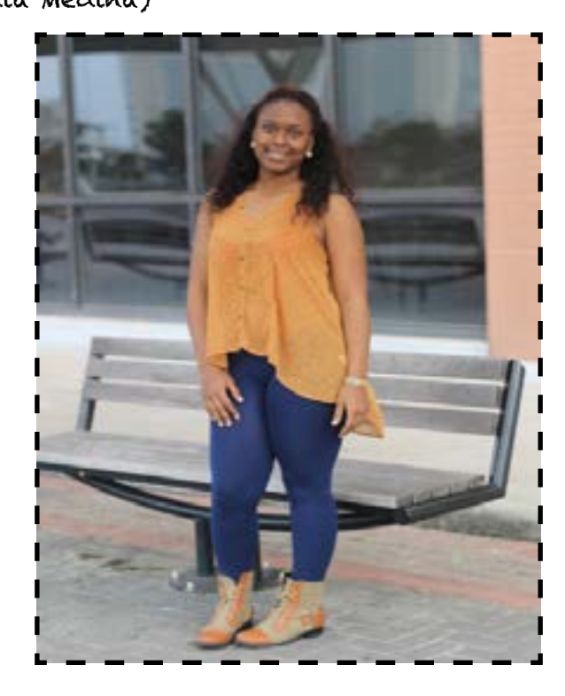
Breonna Coneser Shoes - Wet Seal Tights - Dots Shirt - JcPenney Jewelry - Thrift