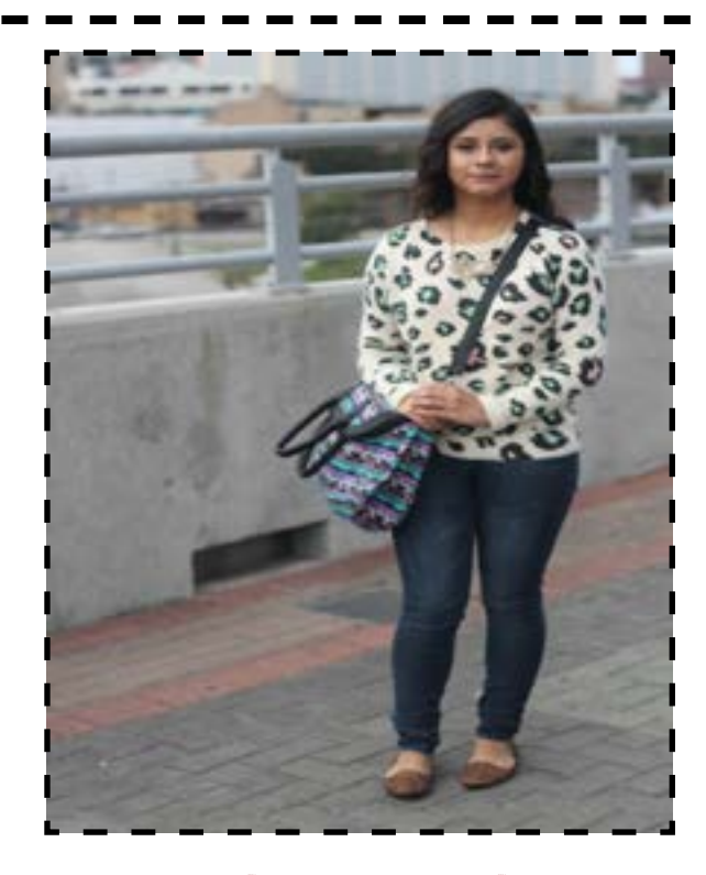
Lupita Negrete Sweater - Forever 21 Pants - Clothes Max Flats - Ross Bag - JcPenney