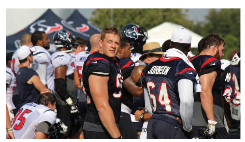
Football fans are excited for the new season of the NFL, and Texans fans have more to be excited about, as Houston is only four years away from hosting Super Bowl LI.