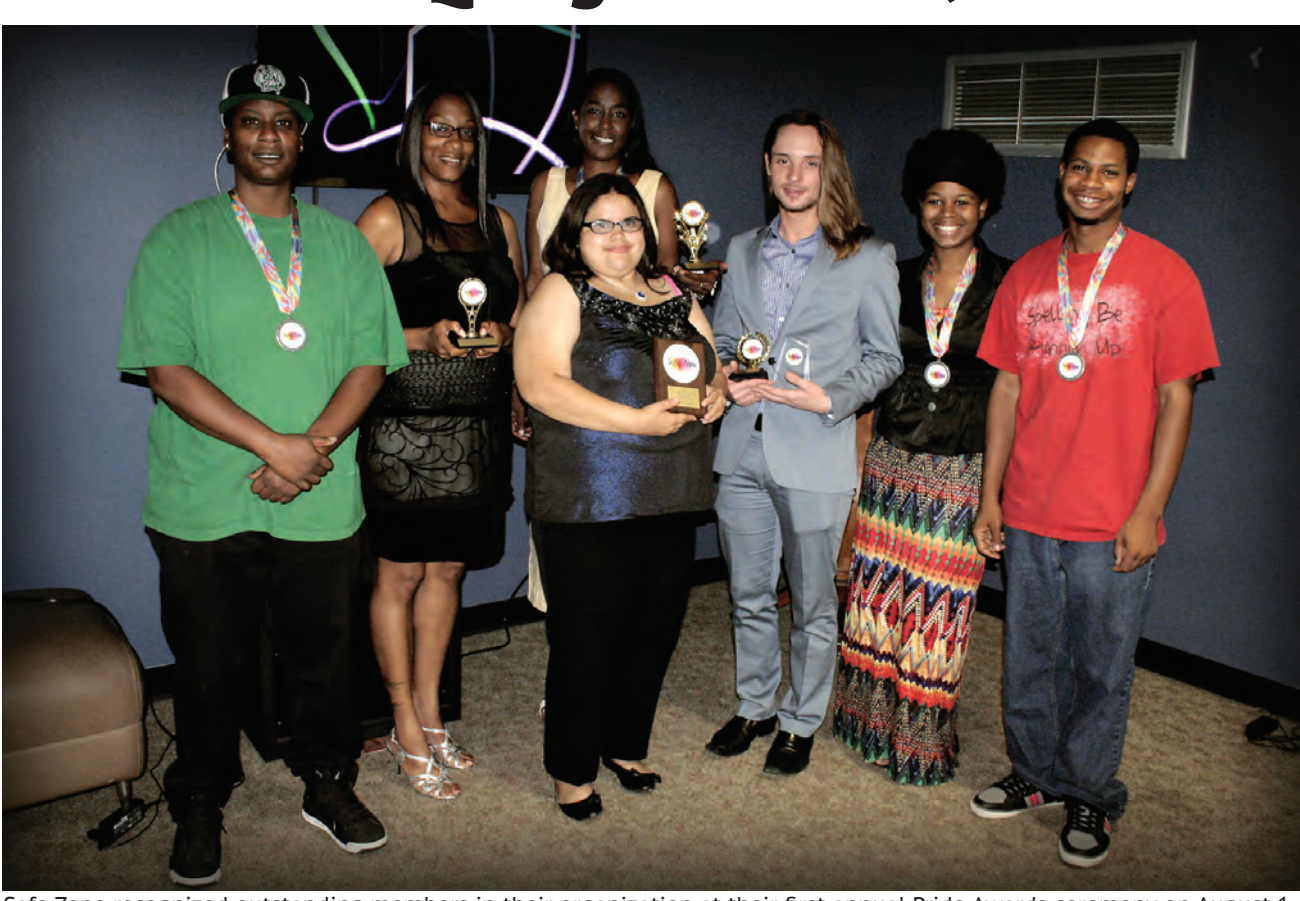
Safe Zone recognized outstanding members in their organization at their first annual Pride Awards ceremony on August 1.\, The LGBTQ organization has their agenda plan out for the fall 2013 semester and welcomes students to join them.