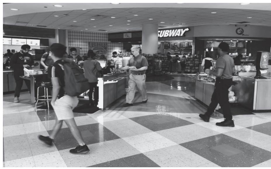
The Cafeteria area is one of the busiest spots on campus. With Gator Cash, it may soon become even busier

that more features of the card such as access to academic and administrative classrooms and event attendance tracking may be introduced in the future. Though at launch, it will serve only as official identification, and act as a way to spend GatorCash, there will surely be much more on this program to come in the future.