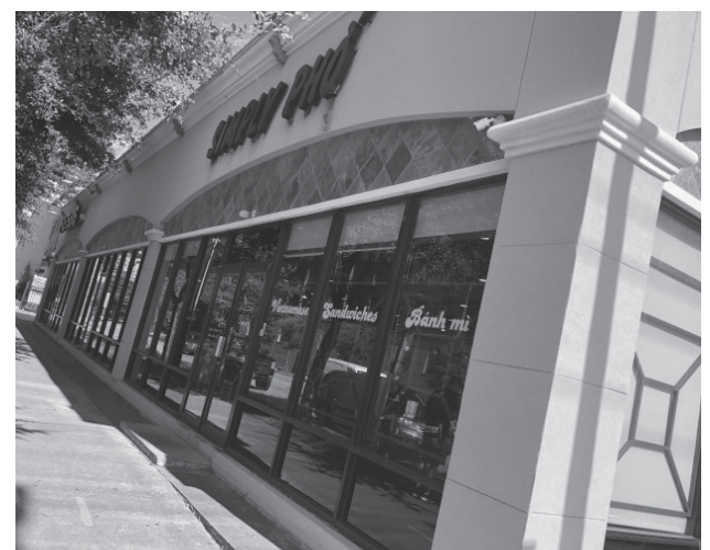
Simply Pho sits in a strip center in the middle of Downtown Houston. A hidden gem

The atmosphere is what first catches your attention when walking into Simply Pho. While it still has a traditional feel to it, the entire space is moderinzed at the same