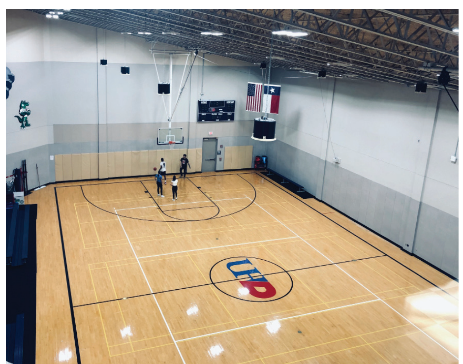
The basketball court inside the UHD student center is currently only used for recreational and club team purposes.

UHD has a similar opportunity upon them. They can provide an alternative to the University of Houston-- who has recently made a name for itself as a major D1 sports powerhouse -- and other Texas universities like TSU, Prairie View A&M