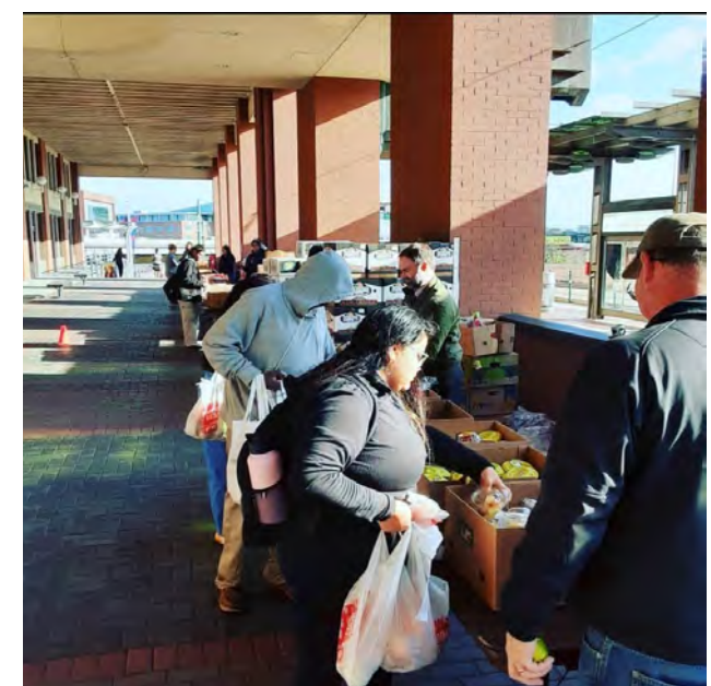
Health Fair offers free fruit and vegetables to UHD Students