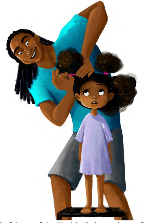
"Hair Love" characters, Zuri, and her father, Stephen struggle to tame Zuri's hair styles commonly worn

lowed by New York and New Jersey. Several cities have passed the law with multiple states currently considering it.