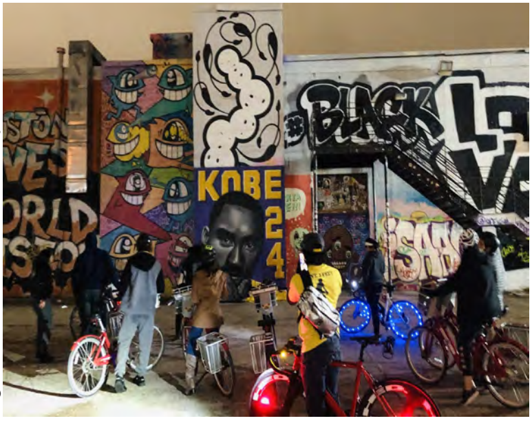
Bicyclists admire the mural at Houston Graffiti Building in Midtown Houston