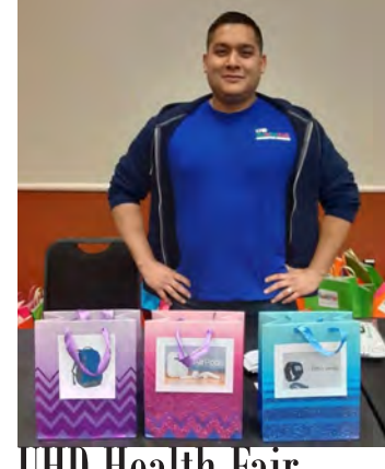
lD Health Fair