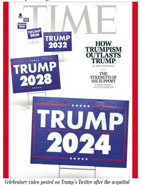
Letebratory video posted on Trump's Twitter after the acquittal

Throughout this ordeal, Trump was optimistic about being acquitted, believing that he was innocent of the charges stated against him.