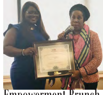
Empowerment Brunch see Gator Life, Page 9