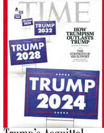
Trump's Acquittal see News, Page 5