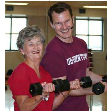
Faculty Profile see Gator Life, Page 8