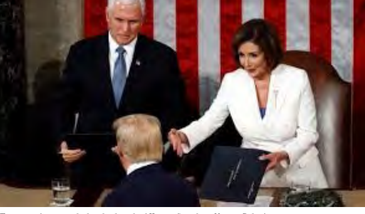
Trump refuses to shake the hand of House Speaker, Nancy Pelosi