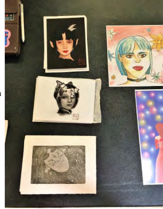
Some of the students' women related artwork that was sold at the fundraiser.

For more updates and information, on UHD's art club, you can follow them on Instagram, Twitter, and Facebook @ArtClubUHD.