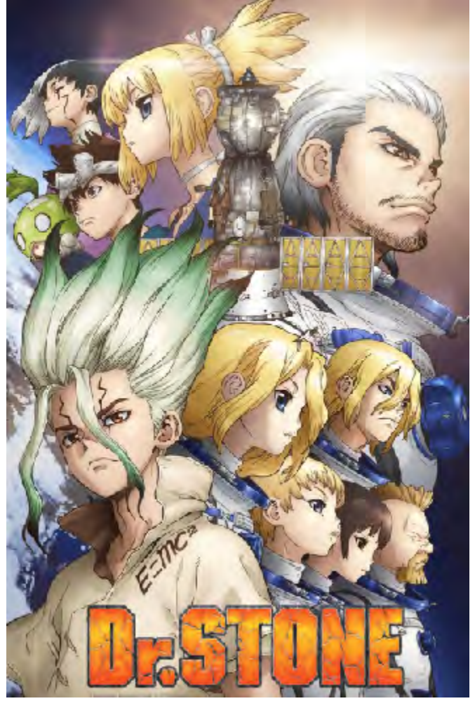
Dr. Stone series poster.

While While While Older animes like Dragon Ball Z or One Piece have stories spanning decades of writing and world building, all you need to know about Dr. Stone is how advanced in technol-