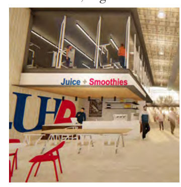
New Wellness and Success Center coming soon to UHD see Gator Life, Page 6-7