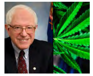
Can Sanders reverse the War on Drugs? see News, Page 4

Wednesday March 25, 2020 | Vol. 64, No. 3