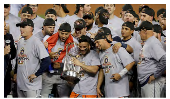
Hosuton Astros celebrate their stolen trophy

Yet without disciplinary measures reaching the Astros, many fans are left wondering, will these new rules be enough to prevent cheating in America's favorite pastime?