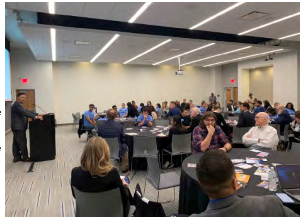
Students and faculty gathered to meet local, state and national candidates.

Whose statements should we believe, the CDC or the "leader" of our country, Donald Trump?