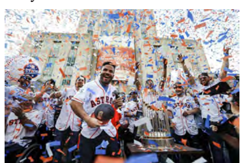
Hosuton Astros parade through downtown Houston following the 2017 World Series.