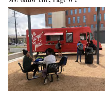
Food trucks on campus see Gator Life, Page 8