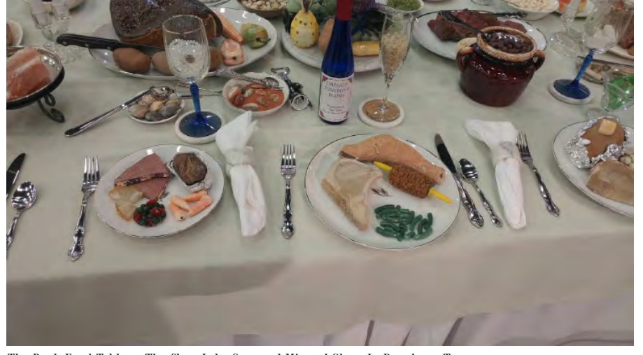
The Rock Food Table at The Clear Lake Gem and Mineral Show In Pasadena, Texas.

The parking lot was still full of cars on Sunday afternoon, just two hours to closing with plenty of purchases yet to be made. This event was similar to the show held in 2019, yet it had seemingly more exhibits and vendors. The rock food table was a very welcome and an unforgettable addition to the 2020 show. A very fun and relaxed experience that surely has left the attendees anticipating the winter of 2021.