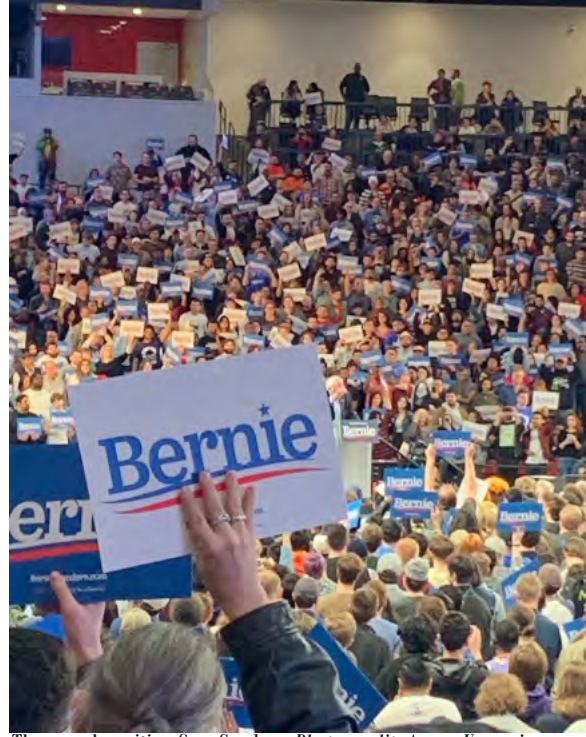
The crowd awaiting Sen. Sanders.

It is crucial to participate in one's community, whether it be volunteering or assisting others. In addition, it is also important to vote for a candidate that serves your best interests. Change can be accomplished one step at a time, but one must