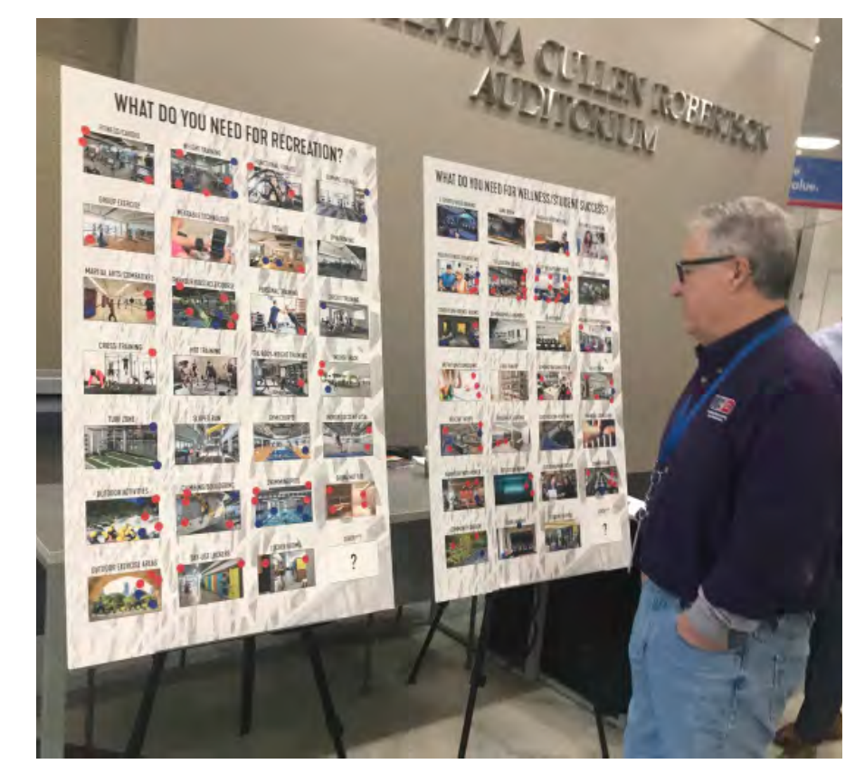
Students and faculty gather outside UHD's Health Fair to vote on which aspects they would most like to see in UHD's new Wellness and Success Center.

Though the sticker voting exercise conducted by SmithGroup does not actually have any final say in what goes into the construction of the building, it is a way to hear students voices and find out what is important to them. As this is a student-focused project, what is important to students is likely to be important in the construction and design of the building.