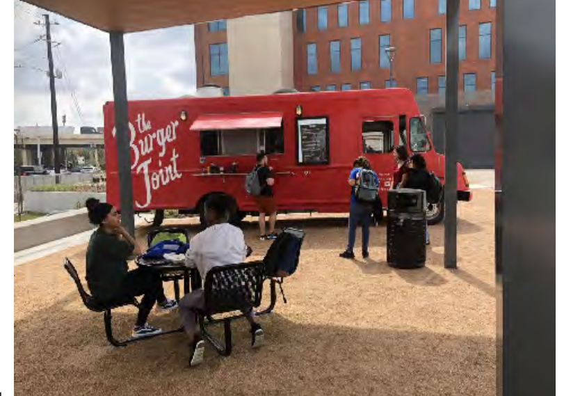
Students enjoying lunch at the Burger Joint food truck.