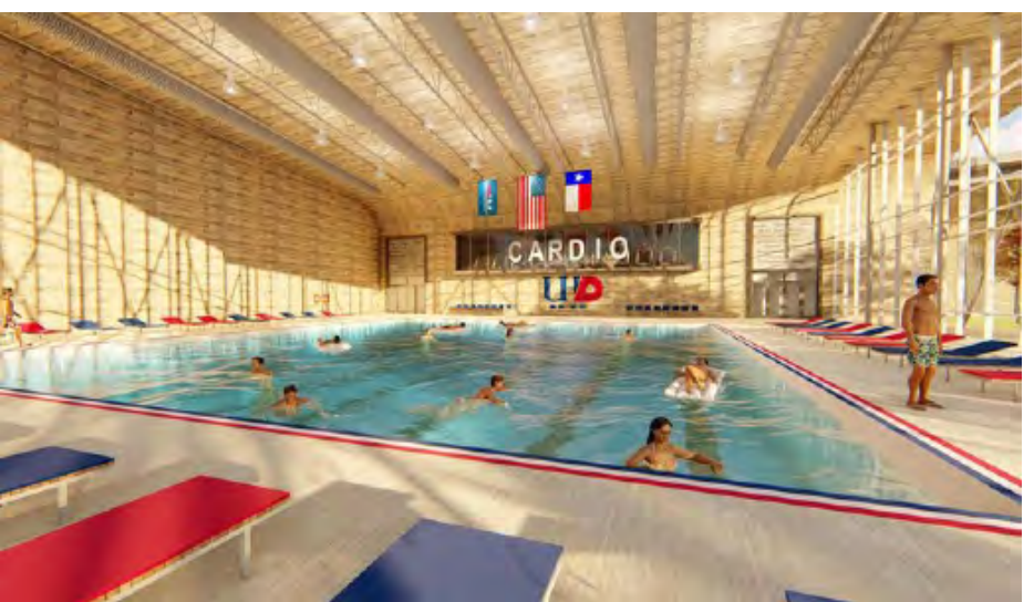
Renderings of possible concepts (a pool and a basketball court) for the new Wellness and Success Center.