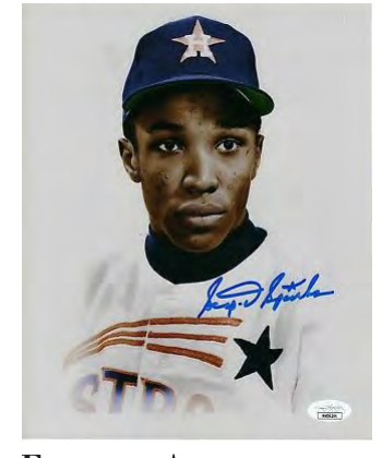
Former Astro to coach UHD baseball see Gator Life, Page 5