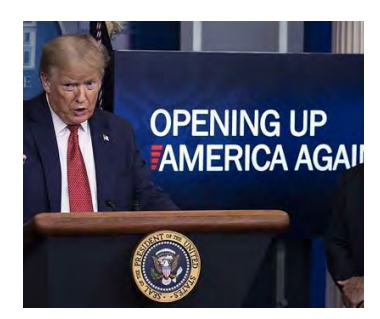
Reopening America see News, Page 7