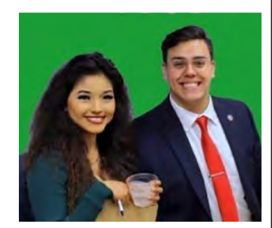
Interview with upcoming SGA officials see Gator Life, Page 4-5