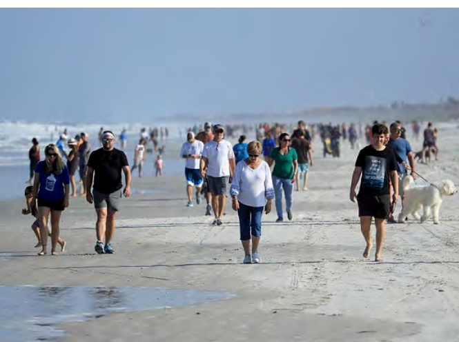
People crowd at Florida beaches after Governor Ron DeSantis has decided to reopen them.

Business es can reopen with certain protocols to protect health and well-being, but visits to senior care facili-