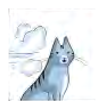
"Allie Cat" Comics see Arts and Entertainment, Page 8