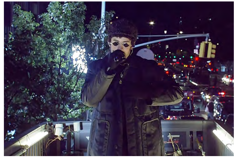
Bad Bunny dodges trees and traffic lights during his live performance from a moving truck in New York City.

"I think it's great that he can combine amazing music with a meaningful message," Treminio said. "To me, he is saying what needs to be said: Women need to be respected no matter if they were born female or not... and consent is important."