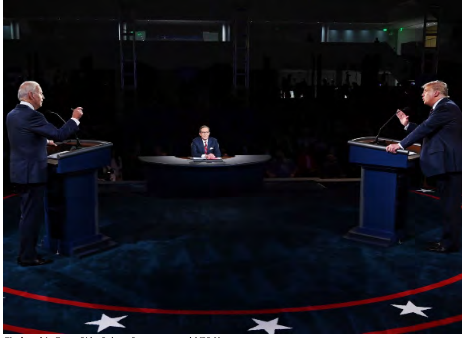
The first of the Trump-Biden Debates.

presidency, Trump has vilified my religion among his supporters, from implementing the Muslim Travel Ban to saying that we were cheering in New Jersey as the Twin Towers crashed.