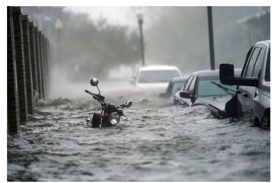
Hurricane Sally floods Pensacola, Florida.

Despite the damage to Alabama and Florida, organizers have scheduled cleanup events that prompted thousands of volunteers, even from other states, to help those in need in the aftermath of Hurricane Sally.