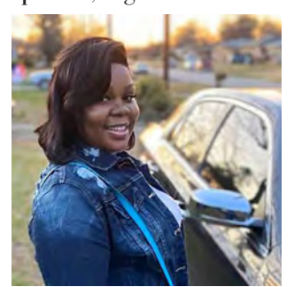
Breonna Taylor case, settlement see News, Page 9 Opinions, Page 12