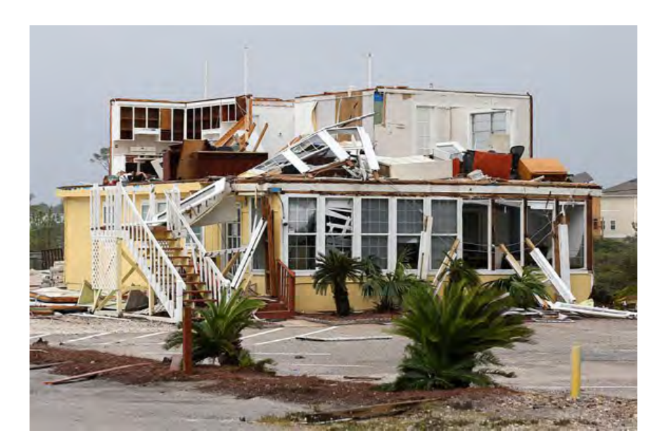
One of the many houses in Perdido Key, Florida that Hurricane Sally damaged with intense winds and 20+ inches of rain.