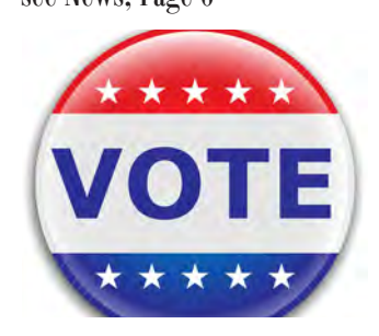
A veteran's thoughts on non-voters see Opinions, Page 10