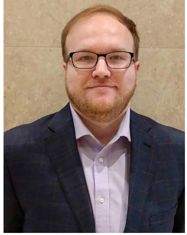
expertise in rhetoric is

passionate about teaching communication courses at UHD. In his short time at the school, he has become an important member of the communication department.