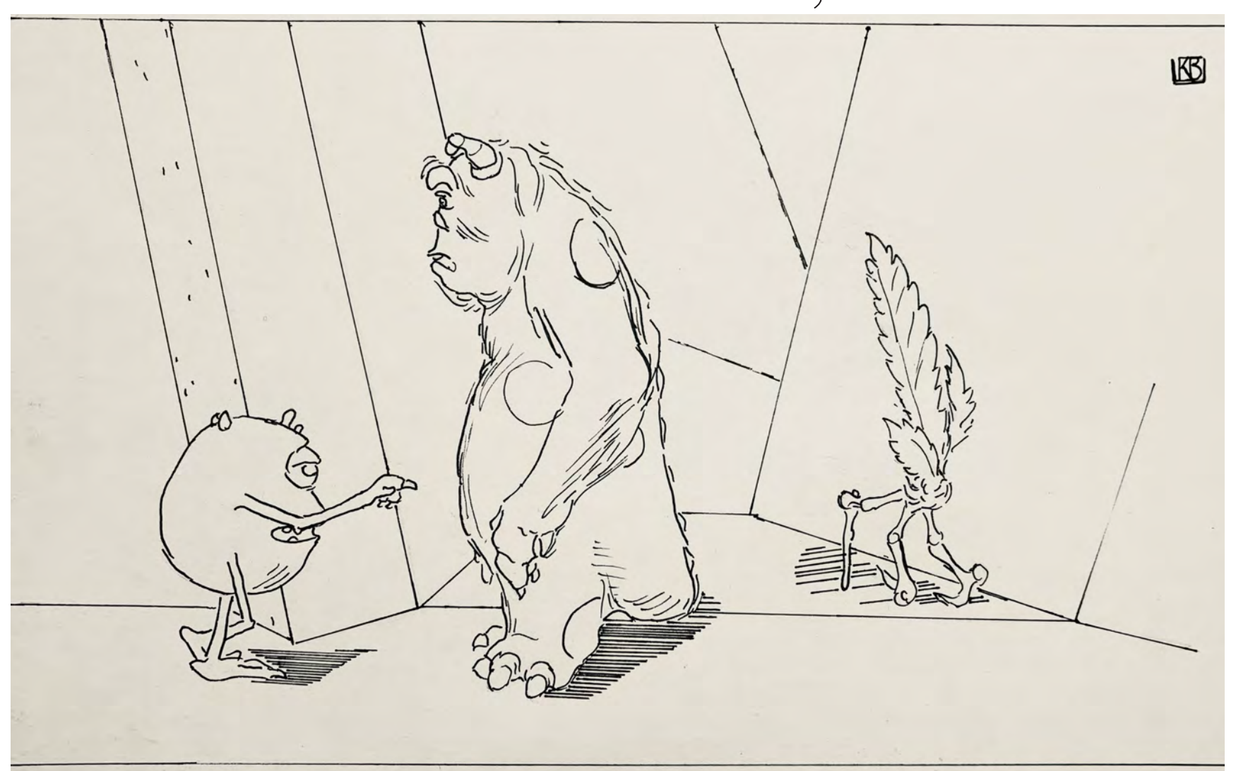
"One of these days, Sulley, we gotta get ourselves transferred to 'Federally Subsidized Fears.' Old man Chronic, there...85 years since 'Reefer Madness' came out, and he's still scaring folks. Talk about job security."