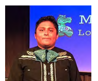
UHD Marachi Band amplifies culture see Gator Life, Page 4