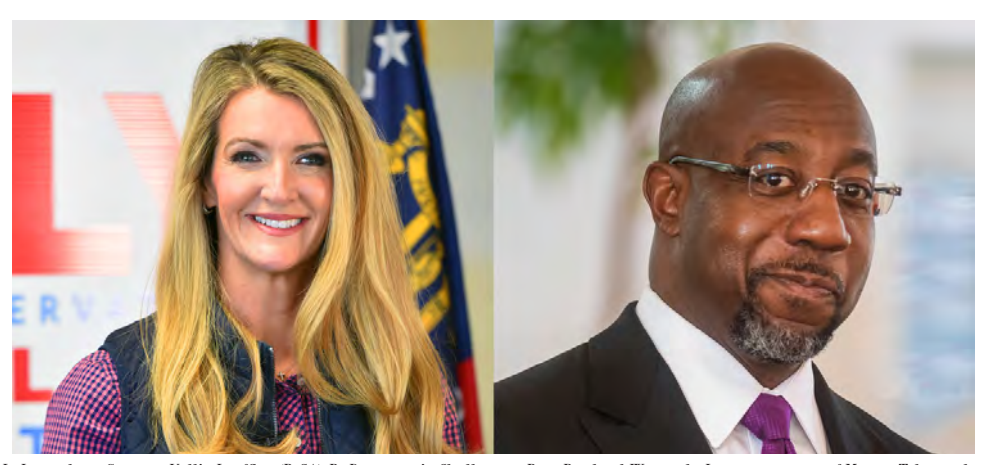
L: Incumbent Senator Kellie Loeffler (R-GA) R: Democratic Challenger, Rev. Raphael Warnock.