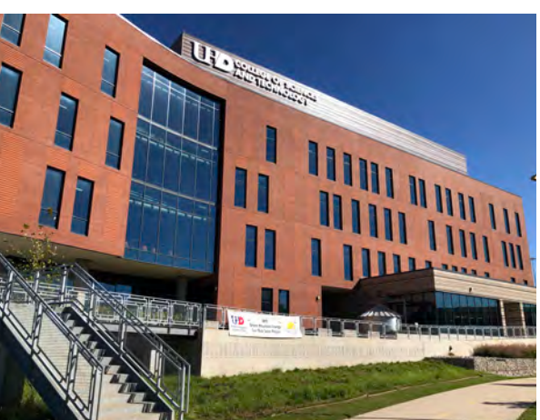
College of Sciences & Technology pending the installation of a solar array made possible by the Green Mountain Energy Sun Club.

For more information about the programs offered by CUAS such as SUSTAIN Scholars, Eco-Reps, and UHD's Gardening Project visit the Center for Urban Agriculture and