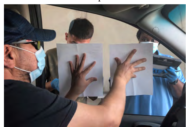
A Harris county resident shows COVID-19 test ID number to Harris County Public Health's COVID-19 response staff at M.O. Campbell Center in Houston, TX on Oct. 19, 2020.

This was not the first reported case of such an incident. In fact, this was the sole reason for the creation of Drive-Thru Voting; to ensure that voters had the safest measures possible in which to cast their ballots during a pandemic. Even though some of the measures I took may have seemed redundant or even extreme, I wanted to make sure that both I and my location remained safe from exposure, regardless of whether or not I had physical contact. I wanted people to know how seriously Harris County took the pandemic and people's health and safety. Though my nerves were a little rattled for a few hours, I was glad that I had a team and county who cared enough to make sure everyone could exercise their right in as safe a manner as possible.