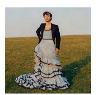
Styles iconic cover sparks controversy see A&E, Page 9