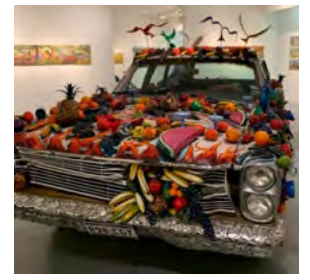
Art Car Museum features local artists see A&E, Page 10