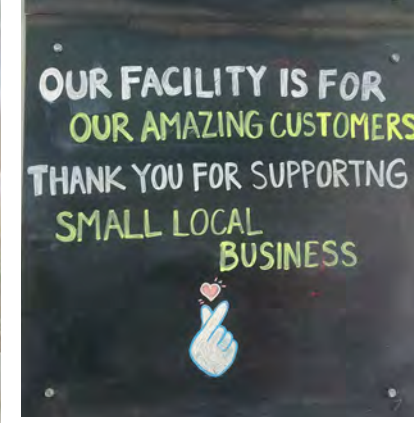
7th Heaven shows appreciation for their customers.

Support local small businesses whenever you can because don't know what you have until it's gone.