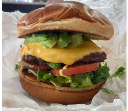
7th Heaven burger.

preparation building a clientele base, testing menu improvements, learning what your customers enjoy,