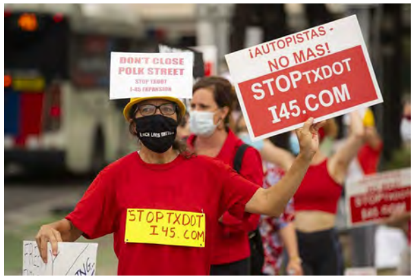
Protestor with Houston community group, "Stop TxDot I-45," holds signs urging people to "Stop TXDOT" during a demonstration at the intersection of Polk and St. Emmanuel, east of downtown Houston on Sept. 3.