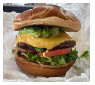
Business Spotlight: 7th Heaven see Gator Life, Page 5