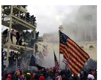
"Kapitolbelagerung" Siege of the Capitol see Opinions, Page 8