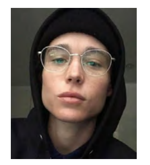
Elliot Page comes out as transgender see A&E, Page 6