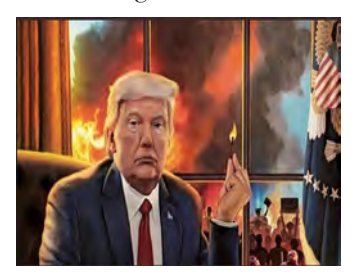
Capitol insurgency and democracy see Opinions, Page 7