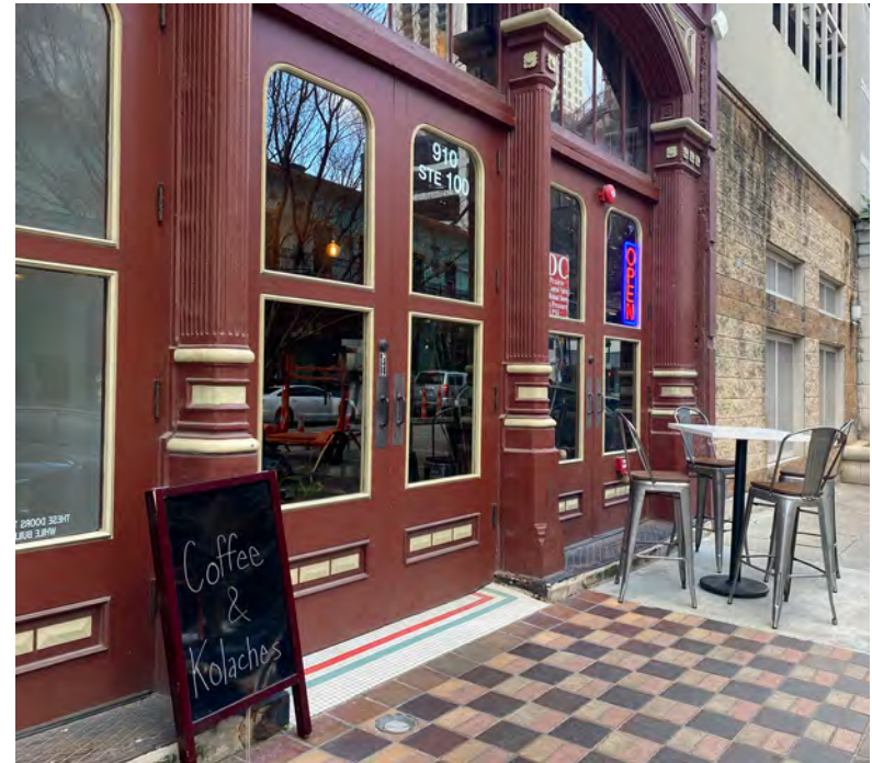
Front porch of Day 6 has no sign indicating its whereabouts, but look out for the checkerboard patio and the address, 910 Prarie St., on the door.