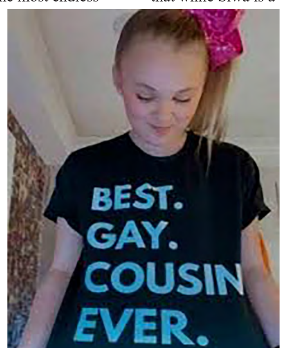
iconic social media post.

It is also important to note that while Siwa is a