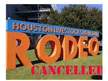
Houston Rodeo canelled again see News, Page 8