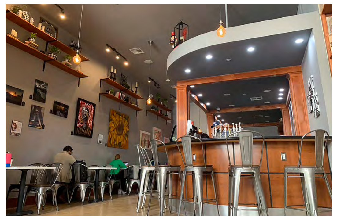
Bar and seating area of Day 6. The coffee joint also offers a small selection of couches, outdoor seating, books and board games.

Whether you are a coffee connoisseur or a sucker for sweets, new local drip house, Day 6 in downtown Houston, has got you covered.