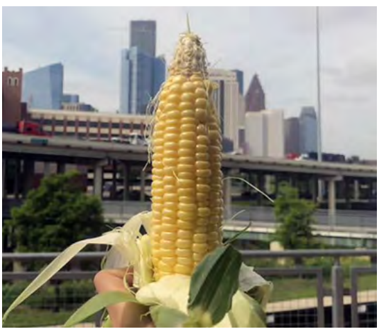
Sweet corn harvest before the downtown Houston skyiline in spring.