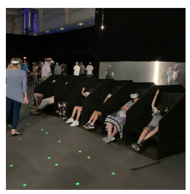
Guests sit down in custom seats to view a space walk.

In zone four guests watched a spacewalk in real time. Once the headsets came off, the experience was not over. Guests were ushered into zones five, six, and seven, where