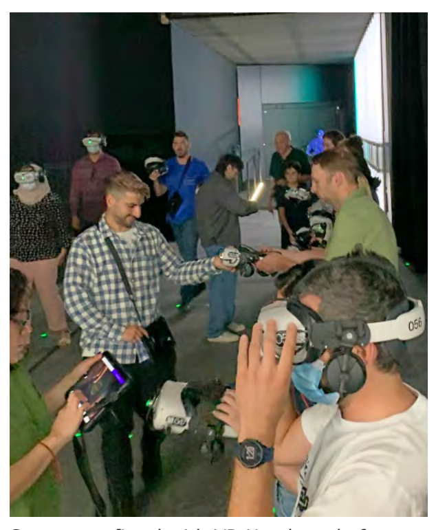
Guests get fitted with VR Headsets before touring the ISS.

one part of the Emmy Award-winning series Space Exploration: The ISS Experience, the largest film production ever done in space. The project was done in collaboration with TIME Studios, the Canadian Space Agency, the ISS U.S. National Lab and NASA.