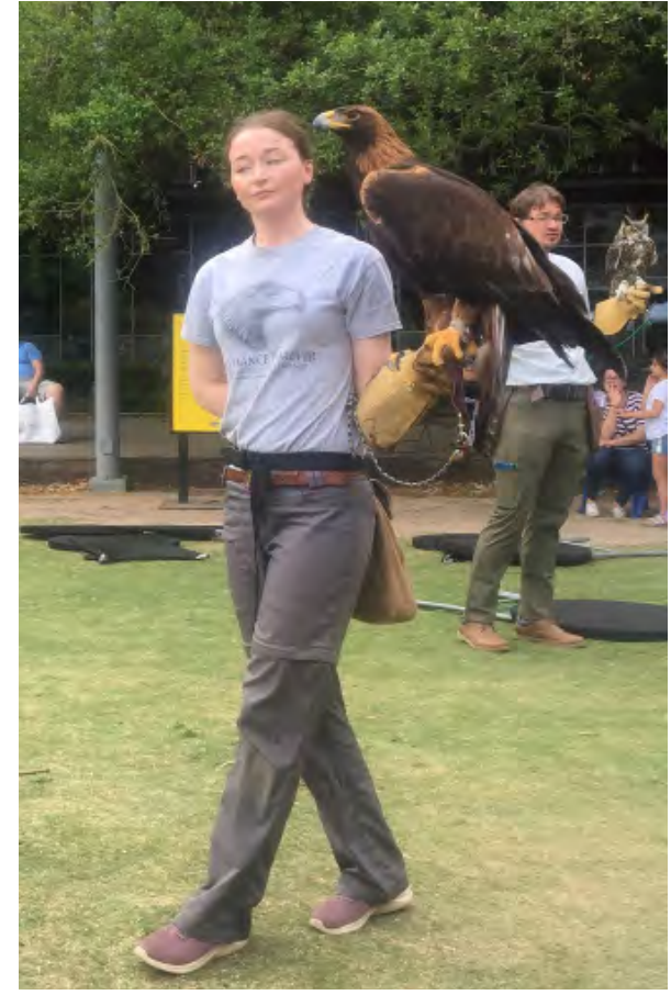
A bird handler shows off eagle at Discovery Green's earth day.

"As an added bonus, turning off non-essential lights also saves energy and money for cities, local businesses, and homeowners," the entity states.