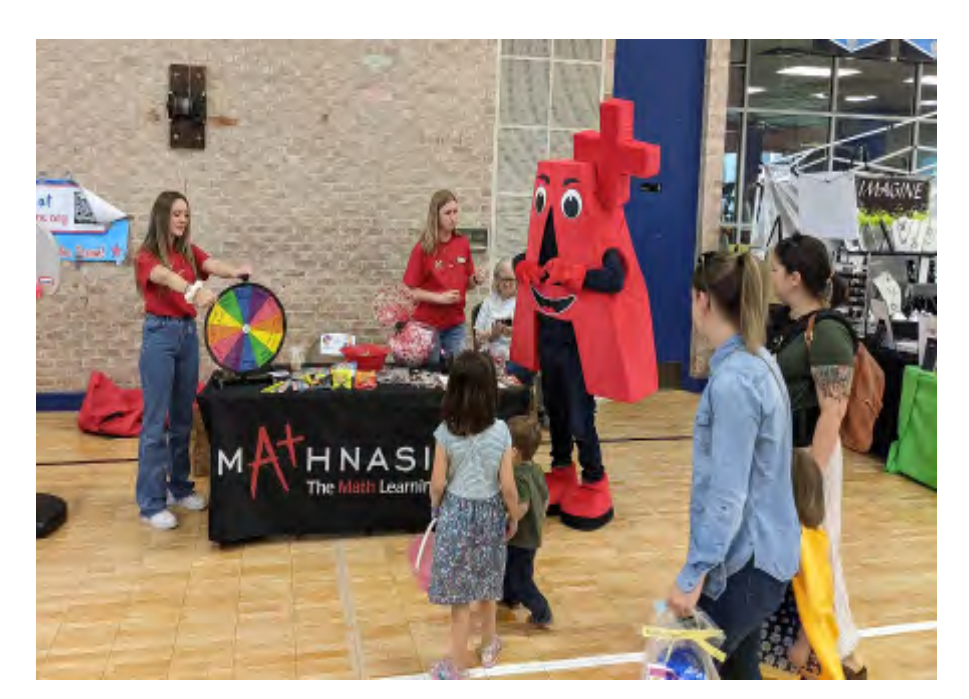
Mathnasium employees table to play math games with kids at the Clear Lake Community Easter event.