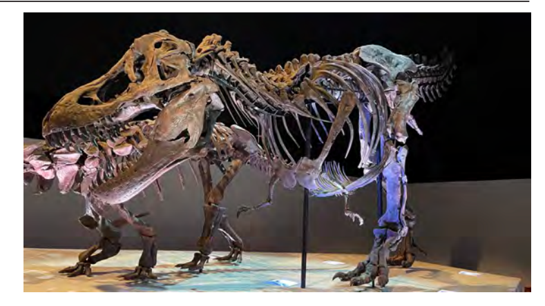
Display of T.rex at HMNS.

Despite its negative impacts on the public, the Jurassic franchise has been an overwhelming boon for paleontology. To end on a