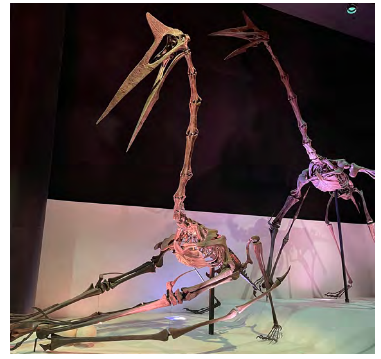
Display of Quetzalcoatlus at HMNS.