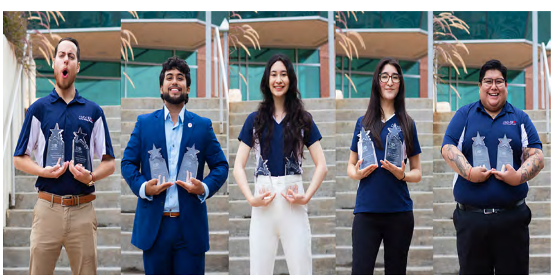
AMA Spring 2022 officers showing off their trophies.

With the pandemic causing significant ripples throughout the world, student life at UHD was a topic of