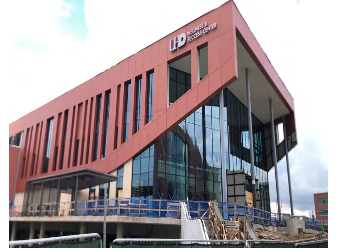
Photo of nearly completed Student Wellness & Success Center.

As a result, UHD will offer all alumni that have graduated before the center opened a free alumni membership equal to their contribution. Students that have paid that additional fee to construct the facility can enjoy the center based on however many semesters the students contributed.